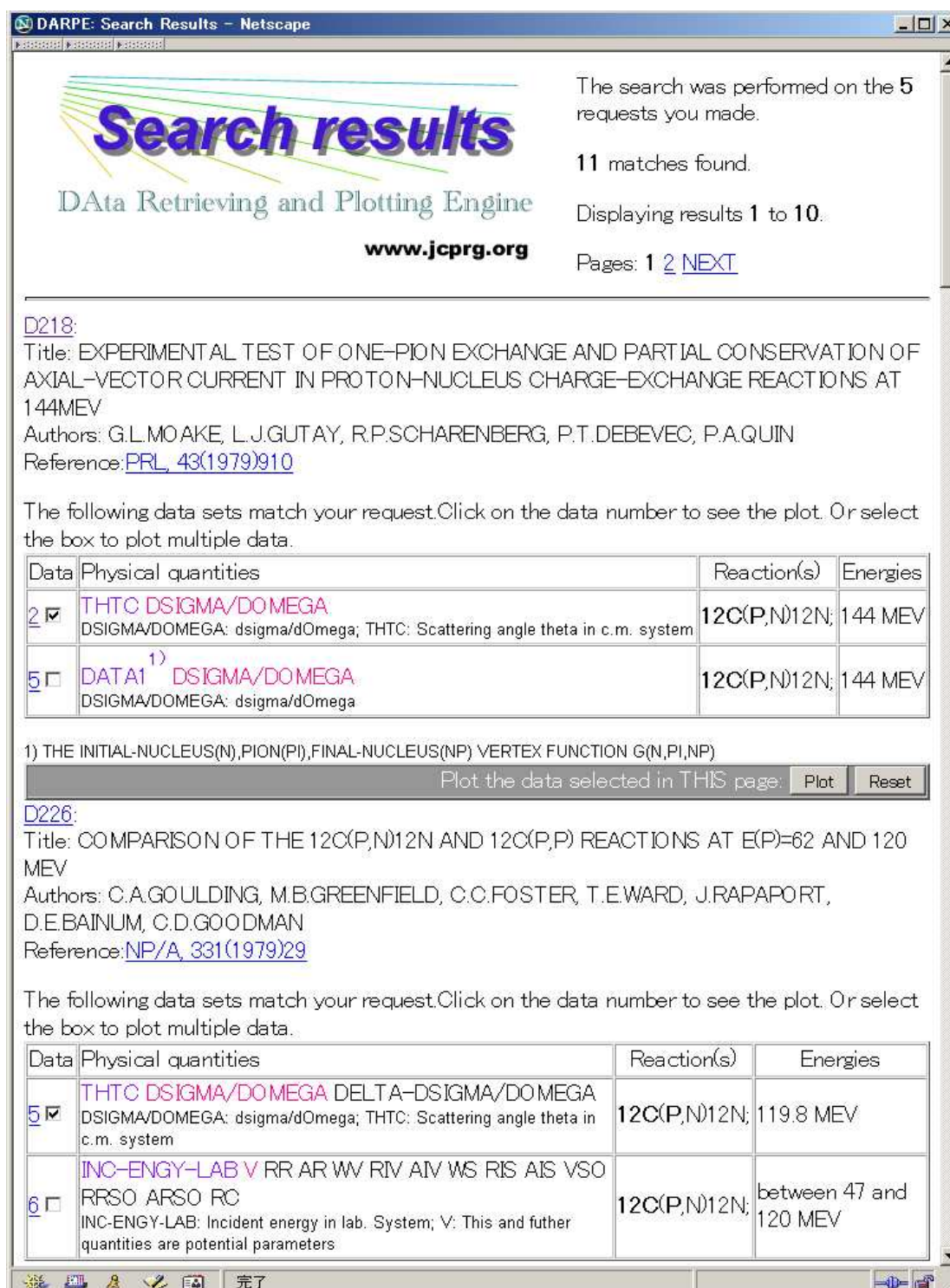
图 2: 检索結果表示画面